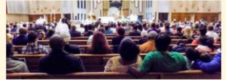
Vigilia de Pascua en 2024

“Que todos sean uno, como tú y yo somos uno” (Juan 17,21) es una oración apasionada de Jesús cuando se preparaba para dejar el mundo y volver a su Padre. La oración extendida es: “Te ruego que