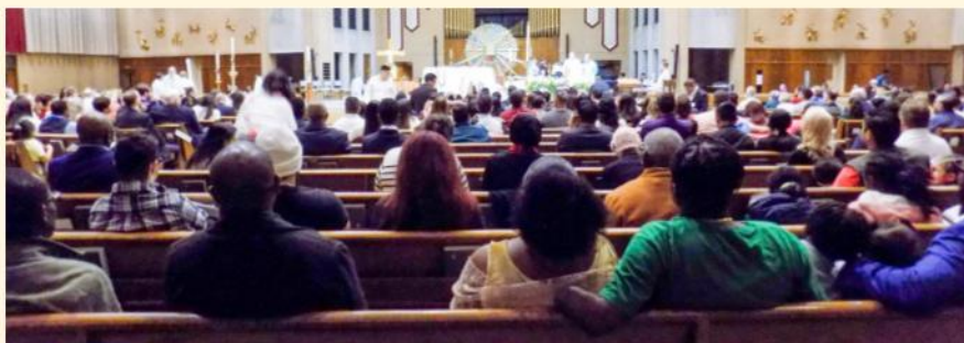
Bread of Life Family of Parishes' Easter Vigil 2024