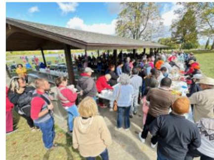
View this bulletin online at www.DiscoverMass.com