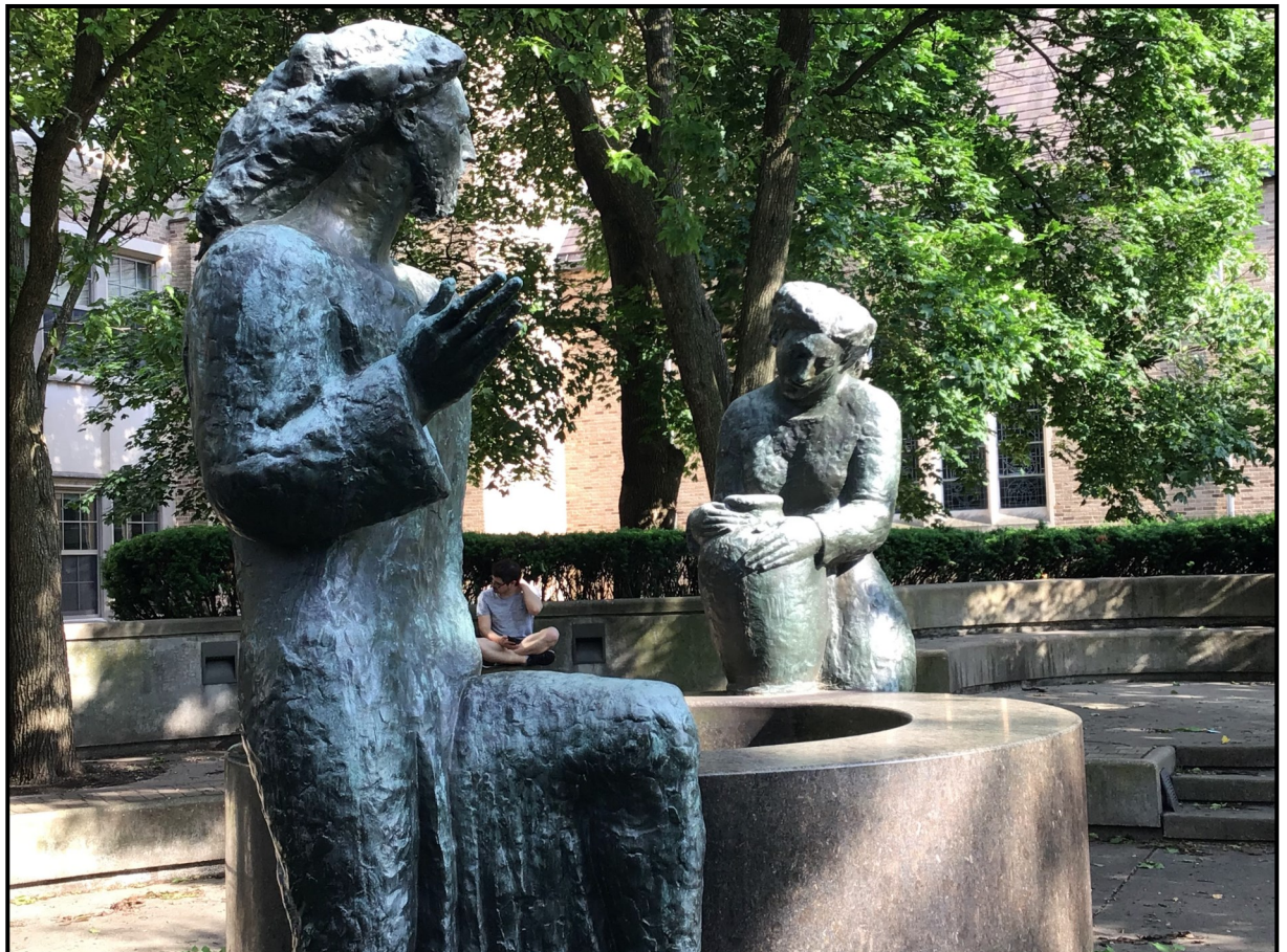
The Woman at the Well, University of Notre Dame

And many people came to believe in Jesus because of her testimony.