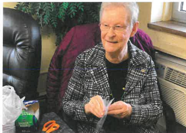
Volunteers helped prepare holiday goodie bags for guardianship clients.